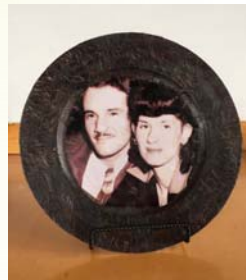
Anniversary Plate by Randa Dubnick

Please contact us for more information or to set up a workshop onsite at your organization.